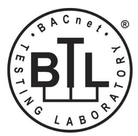
BACnet is a registered trademark of ASHRAE. ASHRAE does not endorse, approve or test products for compliance with ASHRAE standards. Compliance of listed products to requirements of ASHRAE Standard 135 is the responsibility of the BACnet International. BrL is a registered trademark of the BACnet International.